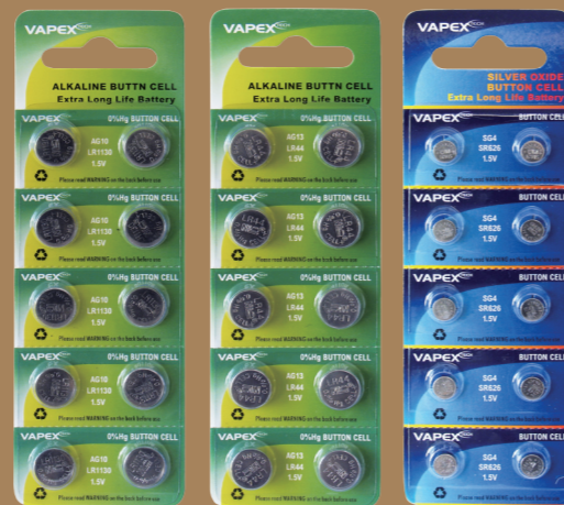
LR-1130/AG10 LR-44/AG13 SR626/SG4