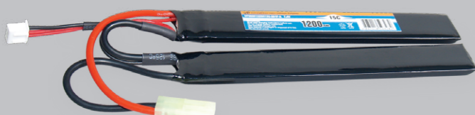
VP5820122SH15C-2S1P-7.4V 1200mAh-A (2 pcs) with Tm1 Connector and 16# Silicone Wires Dimension: 5.8mm*20mm*130mm(single) Weight: 75g Burst Discharge Current: 25C