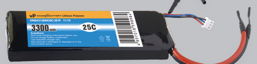
VP6043128SH25C-3S1P-11.1V 3300mAh Dimension: 136mm x44mm x19.5mm, weight 263g