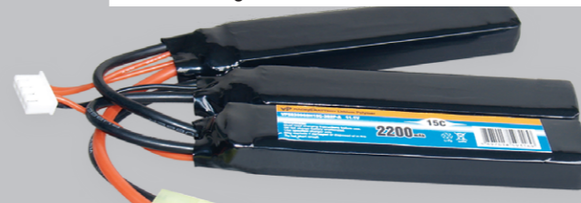
VP582096SH15C-3S2P-11.1V 2200mAh (3 pcs) with Tm1 Connector and 16# Silicone Wires Dimension: 12mm*20mm*105mm(single) Weight: 185g Burst Discharge Current: 25C