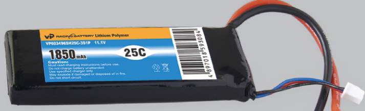
VP603496SH25C-3S1P-11.1V 1850mAh Dimension: 108mm x35mm x19.5mm, weight 155g