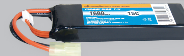
VP582096SH15C-3S1P-11.1V 1100mAh with Tm1 Connector and 16# Silicone Wires Dimension: 17mm*20mm*105mm Weight: 90g Burst Discharge Current: 25C