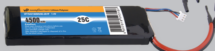
VP7543150SH25C-2S1P-7.4V 4500mAh Dimension: 160mm x44mm x16mm, weight 253g