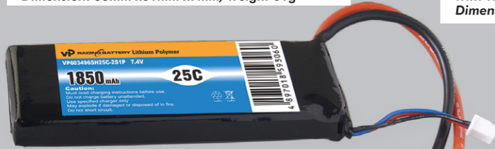
VP603496SH25C-2S1P-7.4V 1850mAh Dimension: 108mm x35mm x13mm, weight 106g