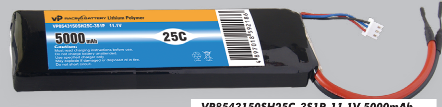
VP8543150SH25C-3S1P-11.1V 5000mAh Dimension: 160mm x44mm x27mm, weight 412g