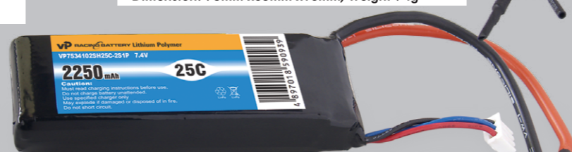
VP7534102SH25C-2S1P-7.4V 2250mAh with DT2 (Deans T Type) Connector. Dimension: 112mm x35mm x16mm, weight 118g