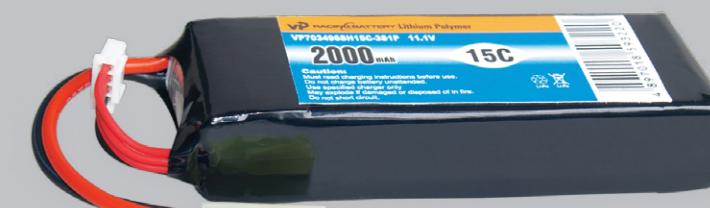
VP703496SH15C-3S1P-11.1V 2000mAh with Tm1 Connector and 16# Silicone Wires Dimension: 22mm*34mm*103mm Weight: 162g Burst Discharge Current: 25C