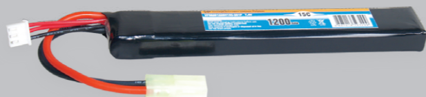
VP5820122SH15C-2S1P-7.4V 1200mAh with Tm1 Connector and 16# Silicone Wires Dimension: 12.5mm*20mm*127mm Weight: 70g Burst Discharge Current: 25C