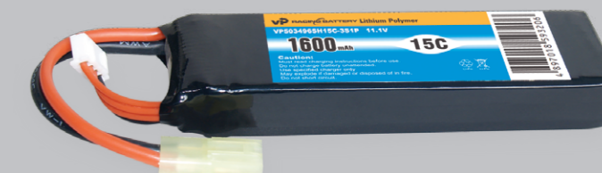
VP503496SH15C-3S1P-11.1V 1600mAh with Tm1 Connector and 16# Silicone Wires Dimension: 16mm*34mm*102mm Weight: 125g Burst Discharge Current: 25C