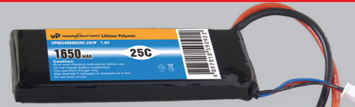
VP603496SH25C-2S1P-7.4V 1650mAh Dimension: 108mm x35mm x13mm, weight 95g