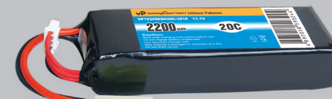
VP753496SH20C-3S1P-11.1V 2200mAh with Tm1 Connector and 16# Silicone Wires Dimension: 24mm*34mm*103mm Weight: 178g Burst Discharge Current: 40C