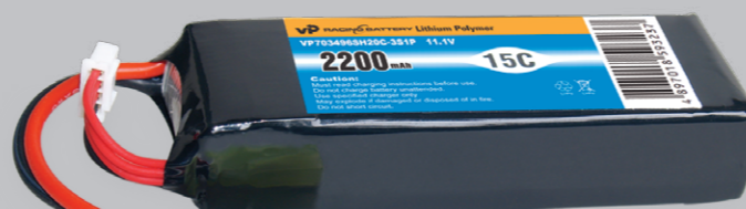
VP703496SH15C-3S1P-11.1V 2200mAh with Tm1 Connector and 16# Silicone Wires Dimension: 23mm*34mm*103mm Weight: 166g Burst Discharge Current: 25C