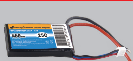
VP423048SH25C-2S1P-7.4V 450mAh Dimension: 55mm x31mm x9mm, weight 31g