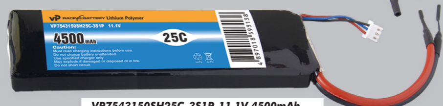
VP7543150SH25C-3S1P-11.1V 4500mAh Dimension: 160mm x44mm x24mm, weight 378g