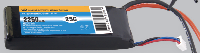
VP7534102SH25C-3S1P-11.1V 2250mAh with EC3 (Blue) Connector. Dimension: 112mm x35mm x24mm, weight 175g