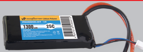
VP653465SH25C-2S1P-7.4V 1300mAh Dimension: 75mm x35mm x13mm, weight 74g