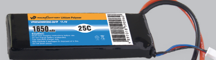
VP603496SH25C-3S1P-11.1V 1650mAh Dimension: 108mm x35mm x19.5mm, weight 142g