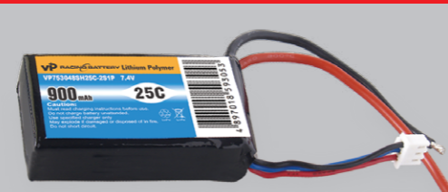
VP753048SH25C-2S1P-7.4V 900mAh with Tm1 (mini-Tamiya Male) Connector Dimension: 55mm x31mm x16mm, weight 50g