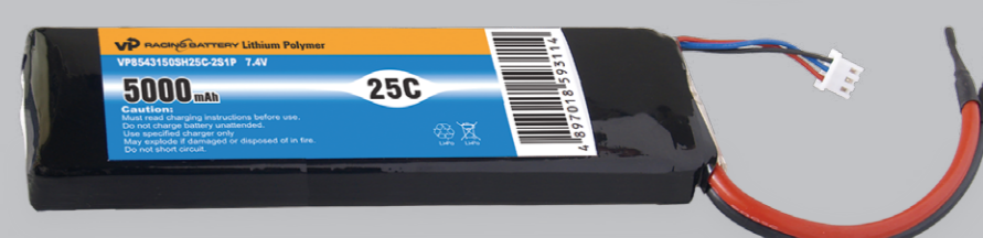
VP8543150SH25C-2S1P-7.4V 5000mAh Dimension: 160mm x44mm x18mm, weight 276g