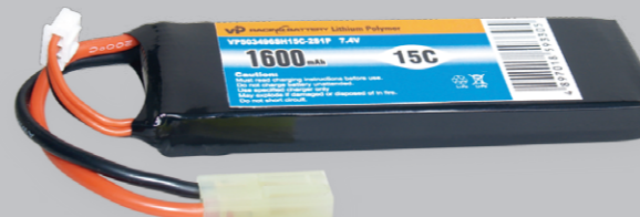
VP503496SH15C-2S1P-7.4V-1600mAh with Tm1 Connector and 16# Silicone Wires Dimension: 11.5mm*34mm*102mm Weight: 86g Burst Discharge Current: 25C