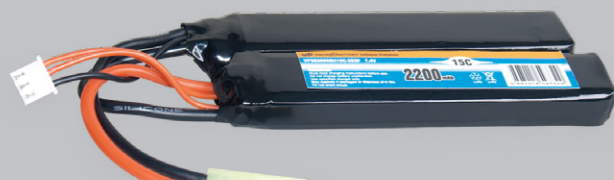
VP582096SH15C-2S2P-7.4V 2200mAh (2pcs) with Tm1 Connector and 16# Silicone Wires Dimension: 12mm*20mm*105mm(single) Weight: 138g Burst Discharge Current: 25C