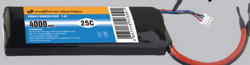
VP8543128SH25C-2S1P-7.4V 4000mAh Dimension: 136mm x44mm x18mm, weight 215g