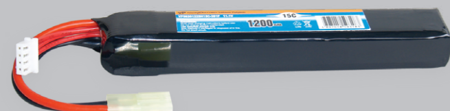
VP5820122SH15C-3S1P-11.1V 1200mAh with Tm1 Connector and 16# Silicone Wires Dimension: 17mm*20mm*127mm Weight: 97g Burst Discharge Current: 25C