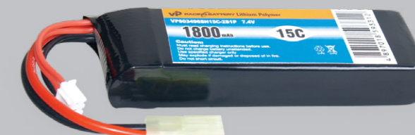
VP603496SH15C-2S1P-7.4V 1800mAh with Tm1 Connector and 16# Silicone Wires Dimension: 13mm*34mm*103mm Weight: 99g Burst Discharge Current: 25C