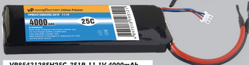
VP8543128SH25C-3S1P-11.1V 4000mAh Dimension: 136mm x44mm x27mm, weight 320g