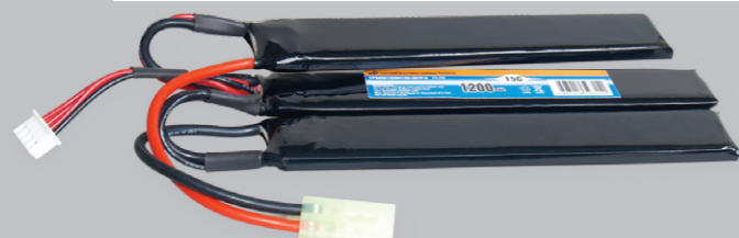
VP5820122SH15C-3S1P-11.1V 1200mAh-A (3 pcs) with Tm1 Connector and 16# Silicone Wires Dimension: 5.8mm*20mm*129mm(single) Weight: 102g Burst Discharge Current: 25C