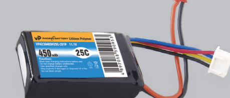
VP423048SH25C-3S1P-11.1V 450mAh Dimension: 55mm x31mm x14.5mm, weight 55g