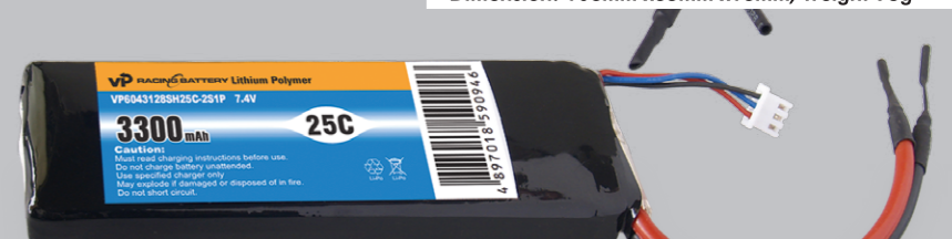
VP6043128SH25C-2S1P-7.4V 3300mAh Dimension: 136mm x44mm x13mm, weight 179g