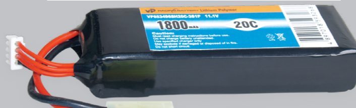
VP653496SH20C-3S1P-11.1V 1800mAh with Tm1 Connector and 16# Silicone Wires Dimension: 20mm*34mm*103mm Weight: 155g Burst Discharge Current: 40C