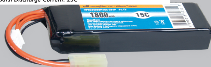
VP603496SH15C-3S1P-11.1V 1800mAh with Tm1 Connector and 16# Silicone Wires Dimension: 20mm*34mm*103mm Weight: 145g Burst Discharge Current: 25C