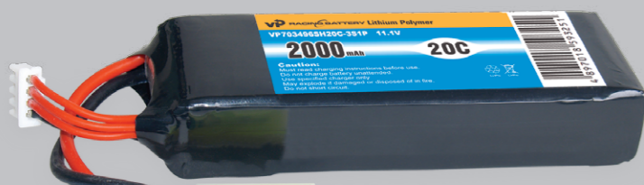
VP703496SH20C-3S1P-11.1V 2000mAh with Tm1 Connector and 16# Silicone Wires Dimension: 21.5mm*34.5mm*103mm Weight: 165g Burst Discharge Current: 40C