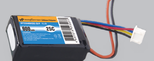
VP753048SH25C-3S1P-11.1V 900mAh Dimension: 55mm x31mm x24mm, weight 73g