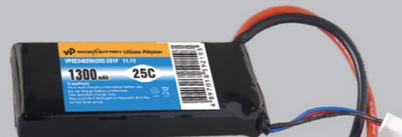
VP653465SH25C-3S1P-11.1V 1300mAh Dimension: 75mm x35mm x19mm, weight 108g